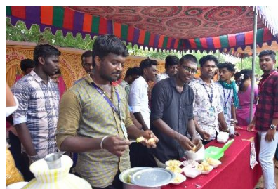
Event Stalls by our college students and Sponsors