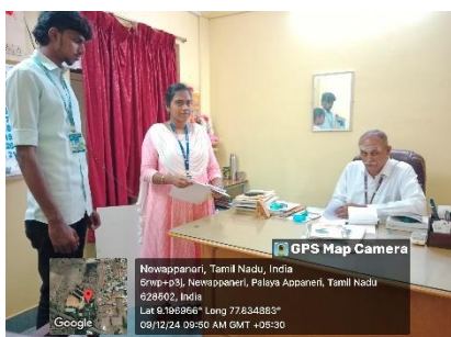
Organizers regulars discussed the process of the event with the Director