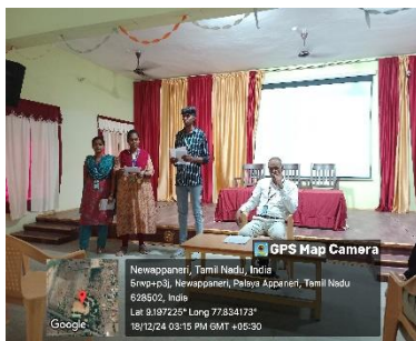
Meeting with the Heads of the Department