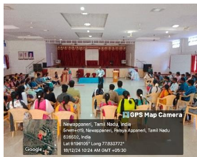
Meeting with the entire team